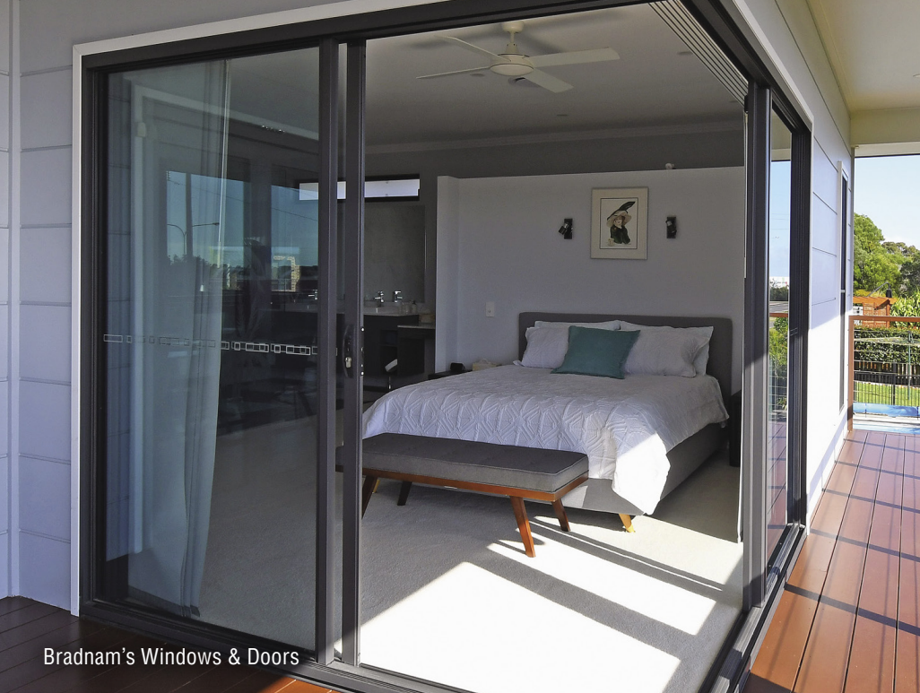
Bradnam's Windows & Doors