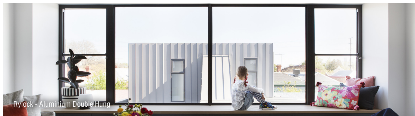
Rylock - Aluminium Double Hung