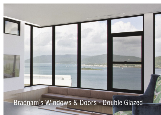
Bradnam's Windows & Doors - Double Glazed