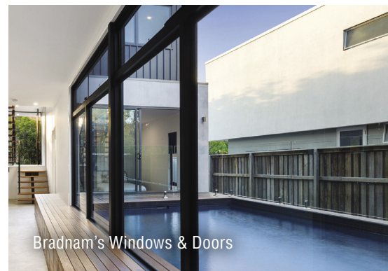
Bradnam's Windows & Doors