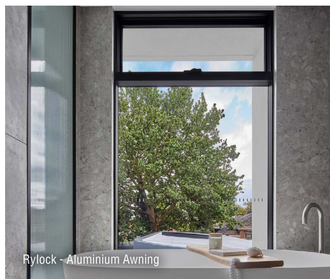
Rylock - Aluminium Awning

Their high strength-to-weight ratio ensures structural integrity and security, and the flexibility of aluminium allows for a variety of window designs, from large picture windows to complex shapes, catering to modern architectural demands. When combined with the right glass, aluminium frames can offer excellent thermal performance and may contribute to better energy efficiency in buildings, which can help you achieve the required energy efficiency rating for your projects.