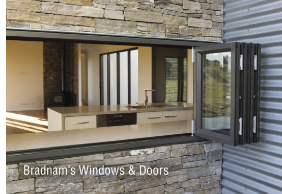
Bradnam's Windows & Doors