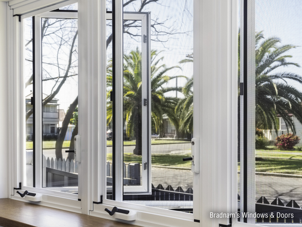
Bradnam's Windows & Doors