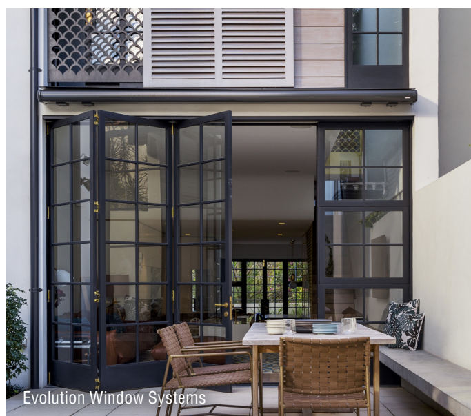
Evolution Window Systems

Versatile in design, glass doors complement various architectural styles with their sleek and modern appearance. Safety tempered glass also ensures durability and resistance to impact, giving you peace of mind without having to compromise on style.