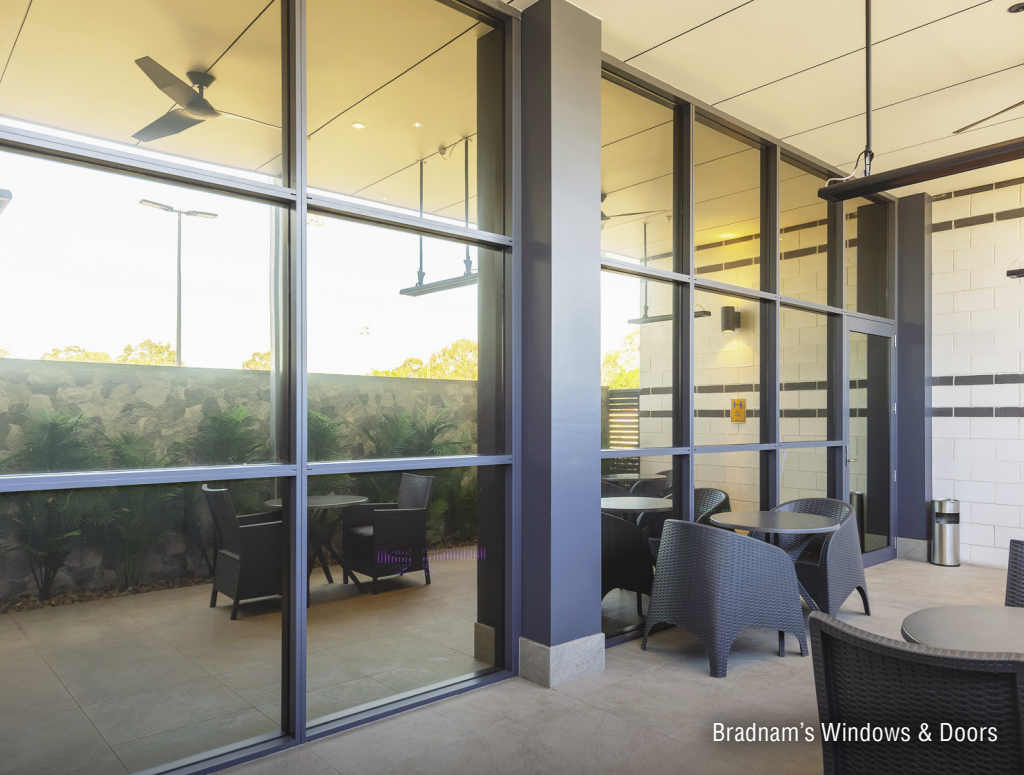
Bradnam's Windows & Doors