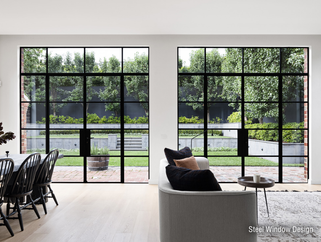
Steel Window Design