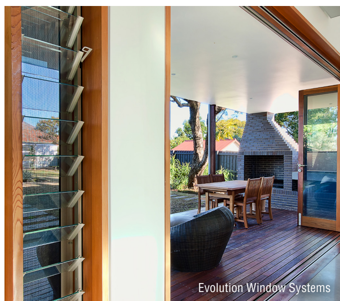
Evolution Window Systems