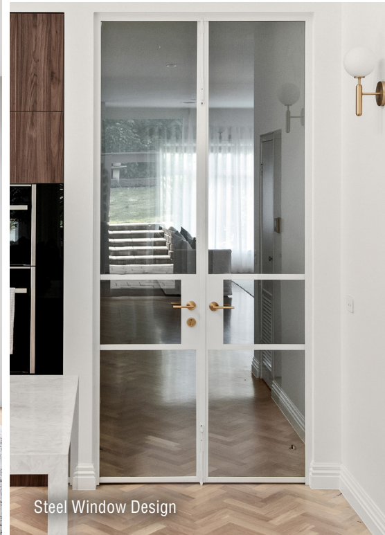
Steel Window Design